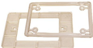
Includes PVC Gasket Set for mounting to J-Box / Weatherproof Box